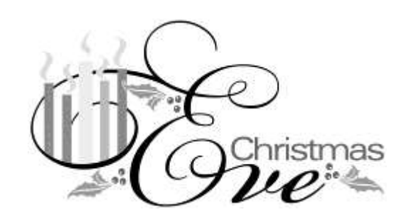
Service at 8:00 p.m.